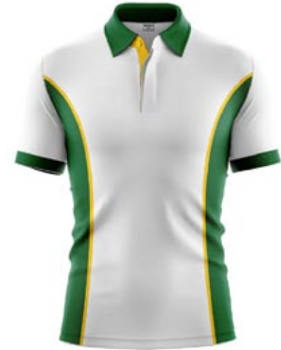
BWL-08 (Cut & Sew)