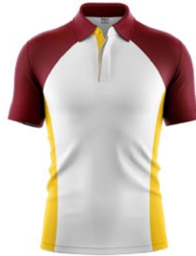
BWL-11 (Cut & Sew)