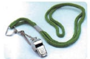
Wistle & Lanyard