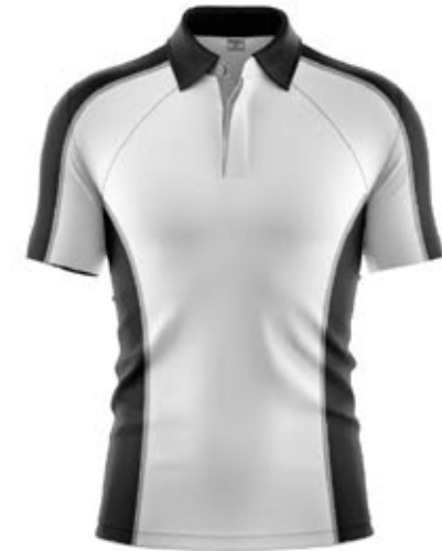
BWL-12 (Cut & Sew)