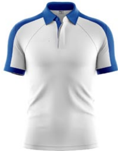
BWL-09 (Cut & Sew)