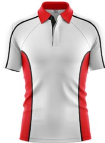
BWL-07 (Cut & Sew)