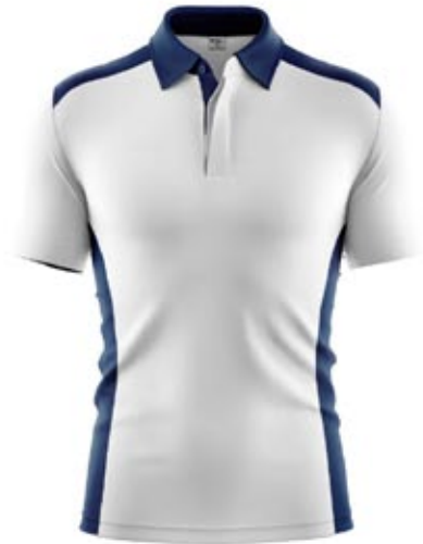
BWL-10 (Cut & Sew)