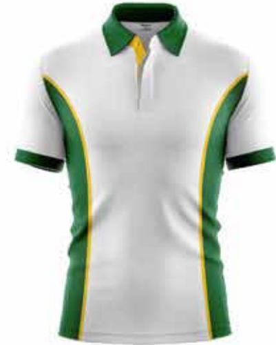
BWL-08 (Cut & Sew)