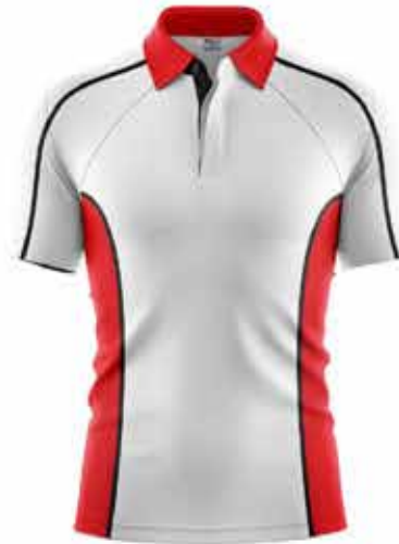
BWL-07 (Cut & Sew)