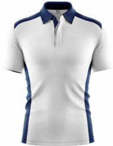
BWL-10 (Cut & Sew)