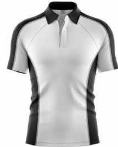
BWL-12 (Cut & Sew)