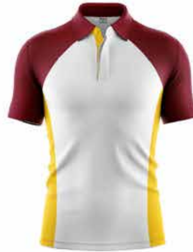
BWL-11 (Cut & Sew)