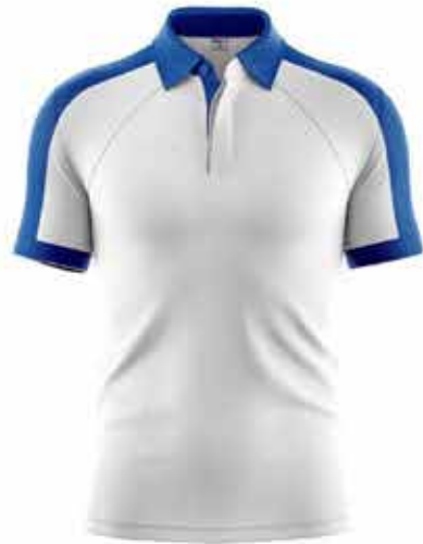
BWL-09 (Cut & Sew)